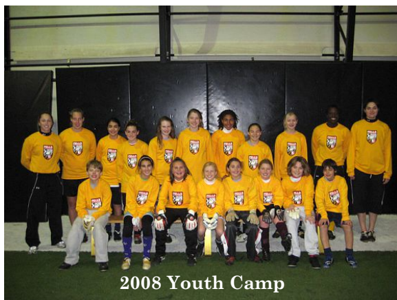
2008 Youth Camp